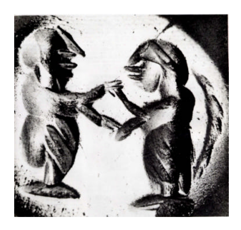
Fig. 3 Ancient Persian stamp seal showing details of intaglio. Cover of the journal Science , 21<sup>st</sup> May 1965.