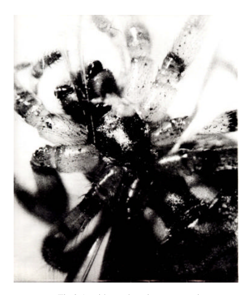
Fig.2 A spider undergoing an operation, photographed by the author. Afterwards she walked away. Cover of the journal Science 3<sup>rd</sup> March 1961.